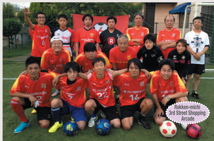
Rokken-michi 3rd Street Shopping Arcade

We create matching t-shirts, uniforms, bags, jerseys, etc. We can help you design original matching wear and goods. Even if you can't draw your own designs, or you only need a small quantity, please give us a call. Our shop created the t-shirt design for the AS Harima Albion soccer team (Nadeshiko League Division 2).