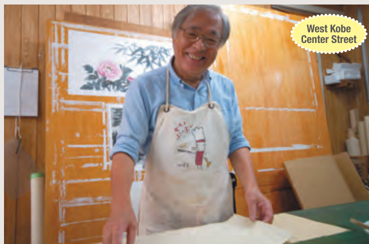
West Kobe Center Street

Established in 1935, Kōgadō continues to provide scroll and painting mounting services, an art-form which is harder and harder to find in modern times. Works of art are mounted using traditional techniques and hand-made washi paper.