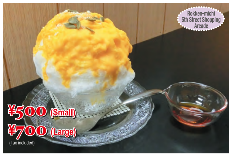
Rokken-michi 5th Street Shopping Arcade

This frozen treat consists of shaved-ice mixed with condensed milk, topped with pumpkin-flavored syrup, with some bittersweet caramel syrup on the side.